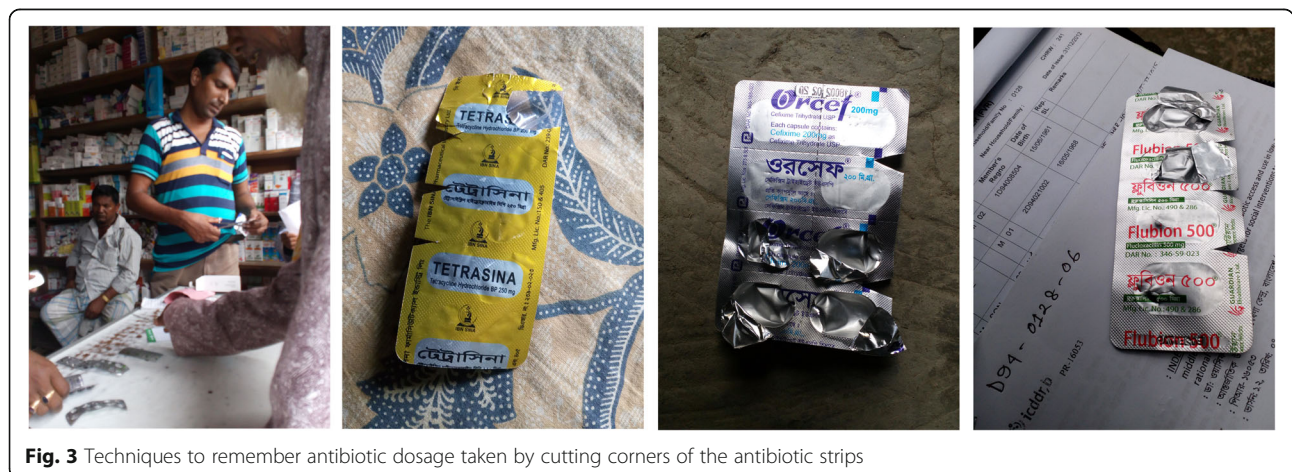
Fig. 3 Techniques to remember antibiotic dosage taken by cutting corners of the antibiotic strips

One informant explained, "Customers are not giving importance to my words. Sometimes I don't want to give the instruction to customers because they consulted with