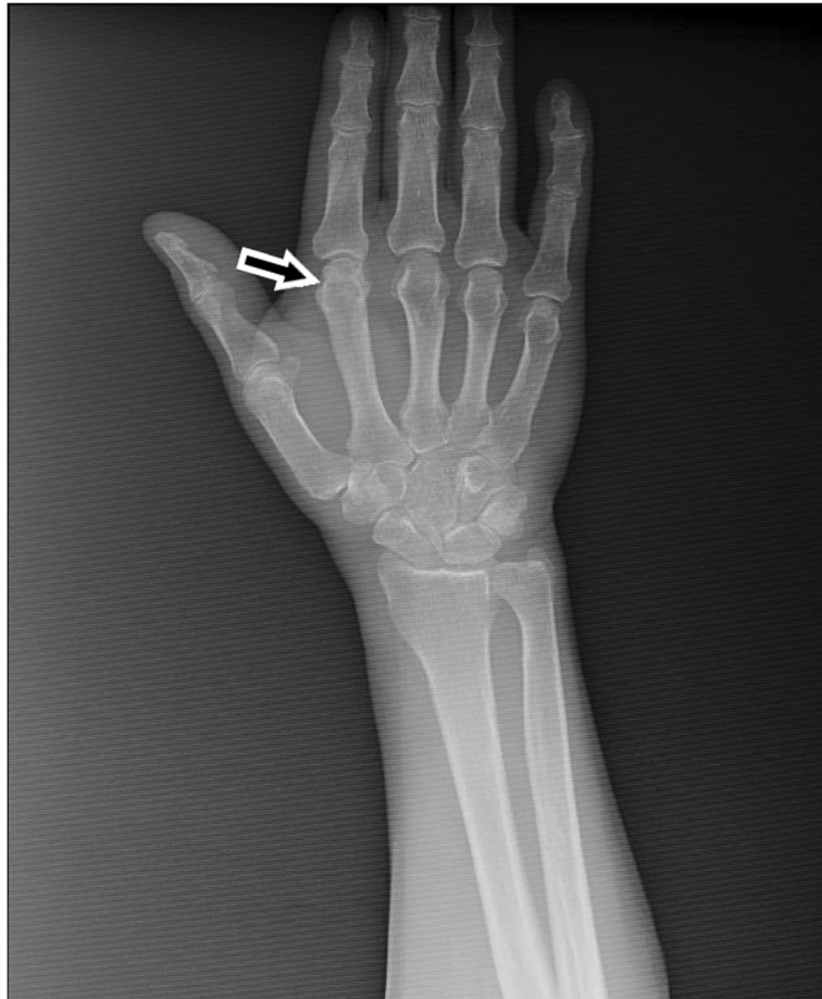
Fig. 1 Conventional radiograph of the right hand and second MCP joint of our patient. The arrow shows the suspected erosion in the second MCP joint

We searched PubMed, MEDLINE, EMBASE, Scopus, and Web of Science using the keywords, 'Behçet's disease [AND] erosive arthritis' and 'Behçet's disease