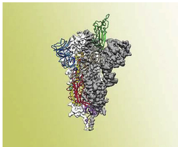
Figure 2. Atomic-level structure of the SARS-CoV-2 spike protein. The receptor binding domain, the part of the spike that binds to the host cell, is colored green. (4).

Some of the mechanisms by which the invading microorganisms are eliminated or neutralized include generation of specific antibodies by the immunocytes that aid in their elimination by elaborating various cytokines, reactive oxygen species (ROS), activation of complement system and other specific and non-specific means to trap and kill them with little or no injury to various tissues. In this process of protecting the body against the onslaught by the microorganisms, there could occur some amount of inevitable inflammation, injury and cell/tissue damage. In order to repair the tissue damage as a consequence of attack by the invading organisms and the resultant inflammatory process, resolution of inflammation and wound healing process need to occur in a coordinated and orderly fashion to