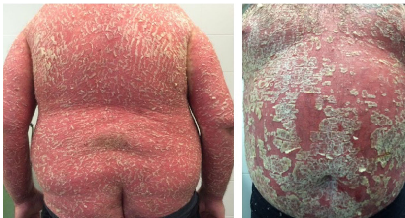
Figure 1 Severe erythrodermic psoriasis (PASI 45) before apremilast treatment.

We report a patient with erythrodermic psoriasis, with contraindication to most treatments because of a recurrent brain oligodendroglioma, who was under apremilast therapy while contracting SARS-CoV-2 pneumonia. The 45-year-old obese (BMI 36.33) white man, with a decennial history of severe psoriasis and arthritis, treated with all traditional and biological drugs had to start chemotherapy with temozolomide, for the brain oligodendroglioma not operable recurrence. Its psoriasis had worsened to erythroderma (Fig. 1), only partially controlled by prednisone 50 mg/day, and in agreement with the neuro-oncologist, apremilast 30 mg orally twice a day was started. The patient gradually improved, allowing prednisone tapering to a minimal dose of 12.5 mg daily. On February 19, 2020, he was enough stabilized to travel to Milan, Northern Italy, to be evaluated for brain radiotherapy. On February 26, he developed a severe cough with high fever (TC 40°C) and a chest X-Ray revealed bilateral interstitial pneumonia with positive swab to SARS CoV2. After referral to the Infective Disease Unit, the patient started treatment with Lopinavir/Ritonavir 400/100 mg twice a day and intravenous Ceftriaxone 2 g/day. He was discharged on March 3, clinically healed after two consecutive negative SARS-CoV-2 swabs. Apremilast had never been stopped during the COVID-19 hospitalization, with acceptable control of the psoriasis, limited to mild scaling and erythema, especially on the trunk (Fig. 2).