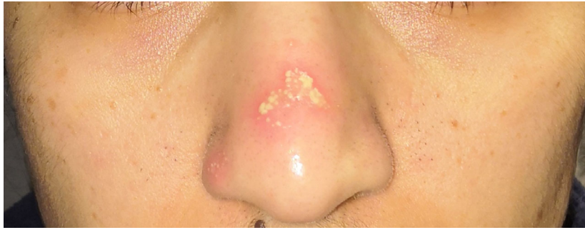
Figure 1 Crops of 1–2 mm pustules with background erythema over the nasal bridge, sidewall and ala, clinically in keeping with localized miliaria.

background erythema were evident over the nasal bridge, sidewall and ala, clinically in keeping with localized miliaria (Fig. 1), with the differential being an occlusive (infective) folliculitis. Whilst tender on palpation, the area was not overtly cellulitic. Given that the epidermis was intact, and wanting to avoid further compromise to the skin barrier, bacterial swabs were not performed. Dermol ® 500 (Dermal Laboratories Ltd, Hertfordshire, UK) lotion was prescribed as an antiseptic soap substitute and emollient. Two weeks later, post-inflammatory hyperpigmentation was apparent in each case, with some residual scaling and dryness.