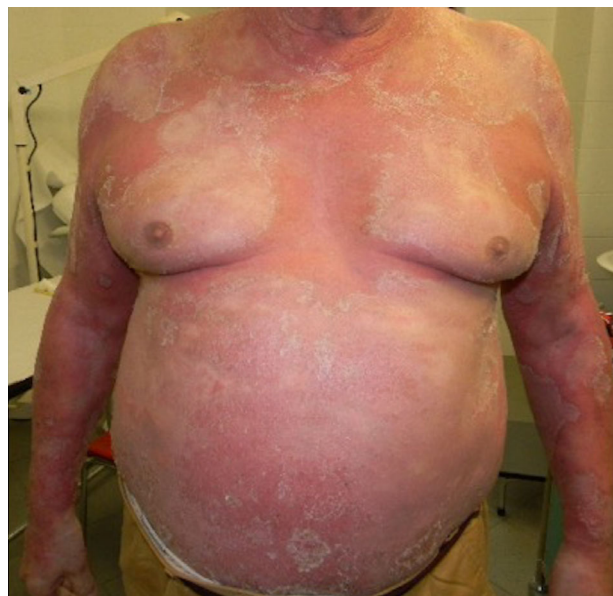
Figure 2 The patient improvement under apremilast treatment, after the COVID-19 recovery.

The fact that patient with a severe form of psoriasis contracted the COVID-19 pneumonia, while on treatment with apremilast is worth of some considerations. First of all, the information of apremilast safety, not interfering with the infection, as the drug was not interrupted during the whole course of the infection. Our patient had several risk factors for a worst outcome: obesity, recent chemotherapy, persistence of brain oligodendroglioma and viral contagion in a nosocomial setting. By converse, the infection recovered rapidly and the patient was discharged 6 days after the onset of symptoms. Apremilast has previously demonstrated a