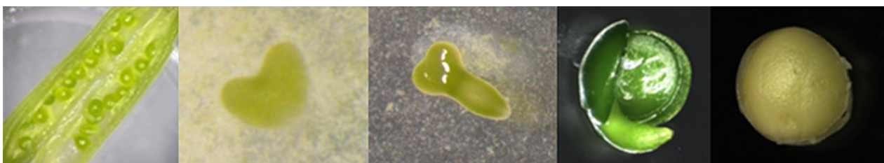
Fig. 1 Developmental stages in Brassica napus and B. oleracea . From left to right: ovary wall and ovules, heart stage embryo, torpedo stage embryo, green stage embryo and mature stage embryo

Brassica plants were grown under controlled environment conditions with a 16 h photoperiod at 18 °C and 15 °C day and night temperatures respectively, under 400 W HQI lighting ( 225 \mu\text{mol m}^{-2}\text{s}^{-1} ). The relative humidity was maintained at 70% day and night. Perforated bread bags (150 mm × 700 mm, WR Wright & Sons Ltd, Liverpool, UK) were used to enclose inflorescences to prevent cross-pollination from neighbouring plants before the plants initiated flowering. Flowers were manually pollinated, and developing seeds were collected at heart, torpedo, green and mature embryo stages. Flowers were tagged when pollinated to determine the developmental stage of the seed, in addition the embryos within the seed were visually checked to ensure they were at the correct stage of development prior to sampling. Buds were collected 24 h before anthesis to obtain ‘pre-fertilization stage’ ovules and ovary wall tissue (Fig. 1). Buds and pods at the desired stage of development were cut from the plant using sterile scissors. Then, they were placed in sterile water