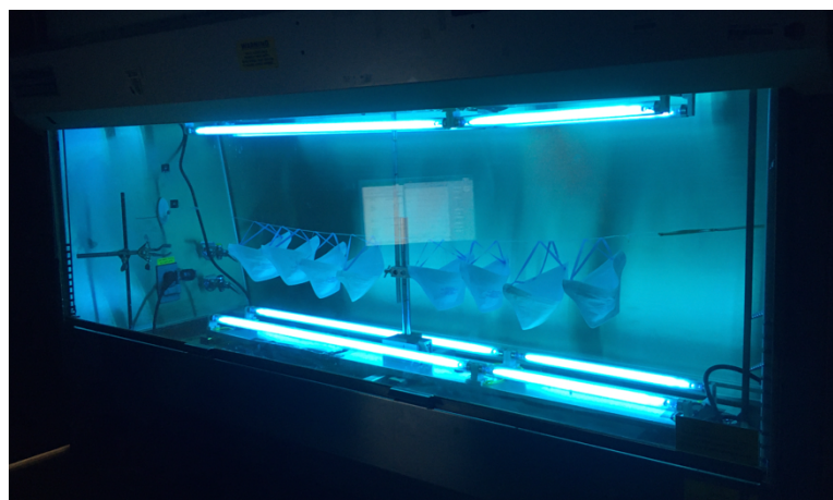
Figure 3. UVGI decontamination chamber constructed within a modified cell culture biosafety hood. Two identical four-bulb UV-C arrays were placed facing each other within the hood, and were used to decontaminate masks prior to construction of the larger array (Figure 1).