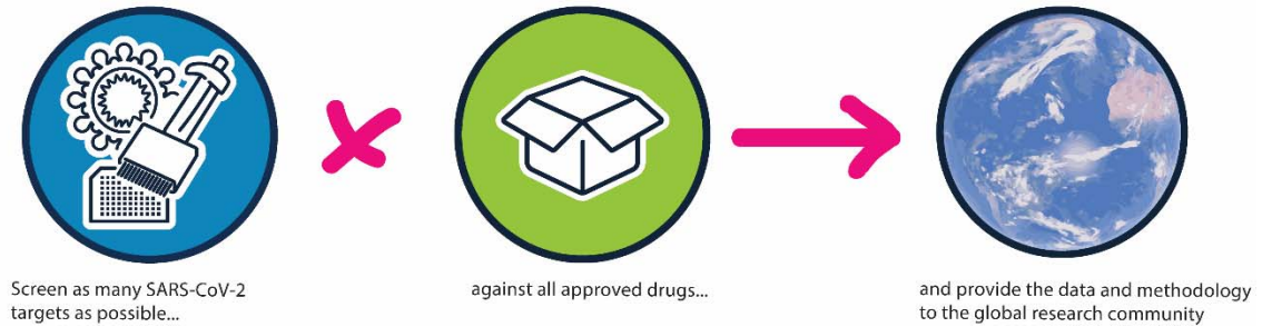
Figure 1. OpenData portal objective. The goal of the OpenData portal is to provide actionable data and validated methodologies to the global research community to support rapid development of therapeutics against SARS-CoV-2.

The assays that have been developed to date cover a wide spectrum of the SARS-CoV-2 life cycle ( Figure 2 ), including both viral and human (host) targets, grouped into the following five categories based on different mechanisms of experimental design: viral entry, viral replication, in vitro infectivity, live virus infectivity, and counter-screens, which could flag false positives due to assay interference artifacts or cytotoxic effects. These assays encompass protein-based assays such as the SARS-CoV-2 spike protein-ACE2 interaction and viral enzyme activity assays, in addition to cell-based pseudotyped particle entry and live virus cytopathic effect assays. As additional assays are validated and screened, this list will be expanded and updated. Importantly, all assay documentation including assay overview, methodology and detailed assay protocols are available, and readily retrievable, on the OpenData site to facilitate adoption and ensure that other laboratories can replicate these assays ( Table 1 ).