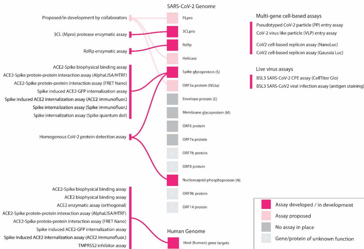
Figure 2. NCATS SARS-CoV-2 assays currently employed to address a range of both viral and host targets. Overview of established assays and those in development. These include assays for specific viral targets, viral-host interaction assays, viral detection assays and viral cytopathic effect and replication assays, among others.

In total, over 10,000 compounds are being tested in full concentration-response ranges from across multiple annotated small molecule libraries including: (1) The NCATS Pharmaceutical Collection (NPC), a library of 2,678 compounds approved for use by the Food and Drug Administration and related agencies in other countries 12,13 ; (2) a collection of 739 anti-infective compounds with potential anti-coronavirus activity that have been reported in the literature as repurposing candidates; and (3) an annotated/bioactive collection of diverse small molecules with known mechanisms of action, including as small molecule probes and experimental therapeutics designed to modulate a wide range of targets, such as natural products, epigenetic-associated compounds or compounds developed for oncology indications 14,15 . Together, these libraries yield 9,958 compound responses, 8,624 of which represent structurally unique compounds, of which 1,820 (21%) are approved for use in humans with an additional 989 (11%) having entered human clinical evaluation (Phase 1-3 trials). Importantly, of these unique compounds, 5,224