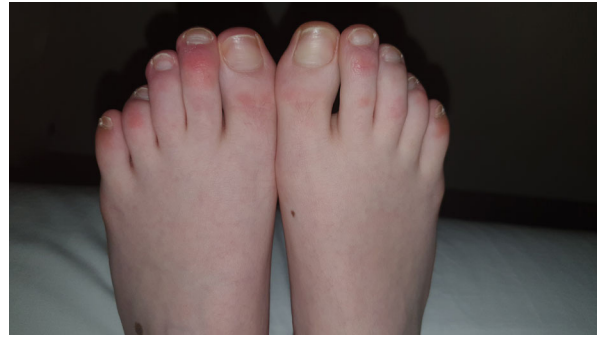
Figure 1 Typical acral cutaneous findings suspicious for COVID-19: erythematous chilblain-like plaques with an asymmetrical distribution in the dorsum of toes.

Of 74 patients, 42 (56.8%) were male. Mean age was 19.66 years (median 14.5 years, range 3–100 years). A small percentage (5.4%) were healthcare workers or had close contact with such workers, while 24.32% reported