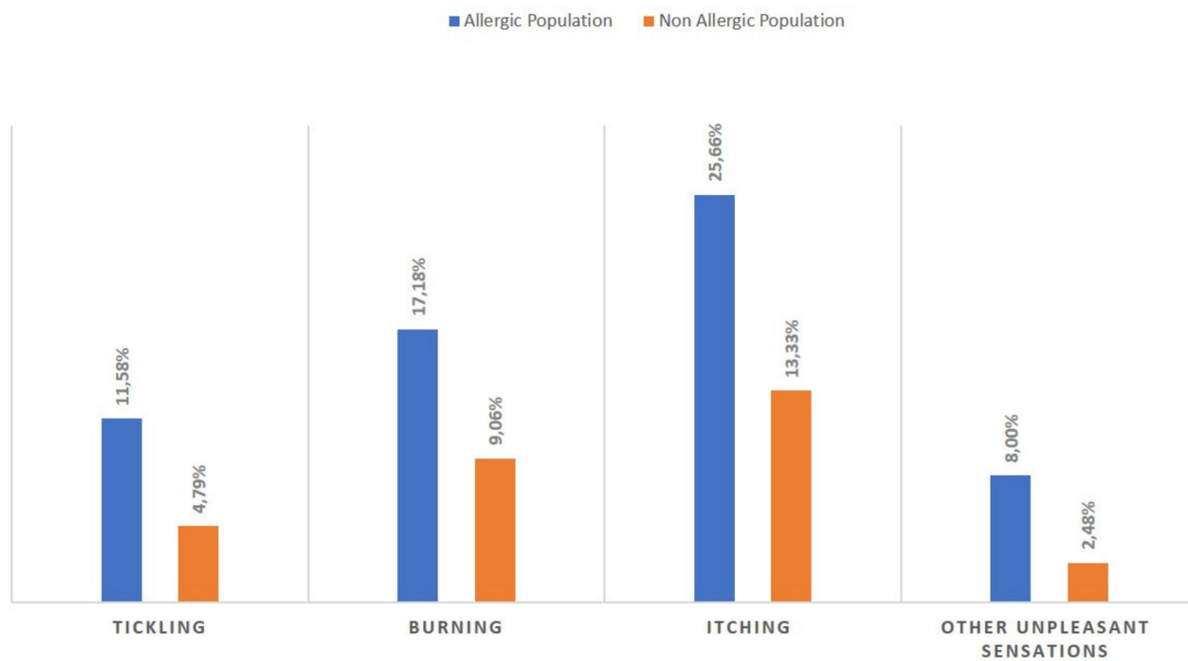
Figure 3. Skin discomforts associated with skincare products in the two populations.