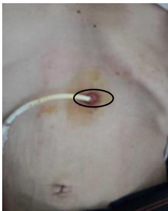
Fig. 1. Patient's gastrostomy site. Black oval: The patient's initial painful area.

Subsequently, the patient's dysphagia symptoms improved and the PEG tube was removed in May 2018. However, the patient continued to experience persistent abdominal wall pain near the