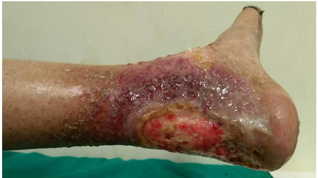
FIGURE 3: Well-defined ulcer with pale granulation tissue and hyperkeratotic margins, with the surrounding skin covered with serosanguinous discharge

Ocular examination showed pseudophakia in both eyes, and slit-lamp examination showed multiple tessellations on the fundus. Routine investigations of the patient were within the normal limits. Hormone levels were within the normal limits except for elevated thyroid-stimulating hormone levels (26 mIU/L) and decreased total serum testosterone (135 ng/mL). Biopsy of the ulcer was performed, which showed no evidence of dysplasia/malignancy. Radiographic examination of hands and feet did not show any signs of osteosclerosis. Carotid Doppler showed early atheromatous changes in the right distal common carotid artery. Semen analysis performed in view of infertility showed decreased semen volume per ejaculate as well as decreased total sperm count. Laryngoscopy revealed fibrosis of the cricoarytenoid and sulcus vocalis (Figure 4).