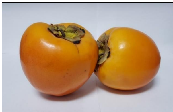
Figure 1. Rojo Brillante persimmon fruits ( Diospyros kaki L.), Protected Designation of Origin (PDO) 'Ribera del Xúquer' samples analyzed in the present study.

Since astringent varieties of persimmon can only be consumed when they are over-ripe, different strategies have been developed to reduce the astringency of persimmon fruits leading to fruits that can be commercialized and consumed keeping their firmness. This can be done by applying technologies such as high hydrostatic pressure, or by storing it in modified atmospheres (CO 2 or ethanol enrichment) which favors the anaerobic respiration conditions and the precipitation of tannins responsible for astringency perception [10–12]. The fruits of 'Rojo Brillante' variety, PDO 'Kaki Ribera del Xúquer' can be treated in this way, leading to the registered brand Persimon ® fruits. Several studies have been conducted on the physiological, sensorial and commercial characteristics of deastringed persimmon fruits [7,8,13]; however, the nutritional composition and bioactive compounds present in treated varieties have been very scarcely studied.