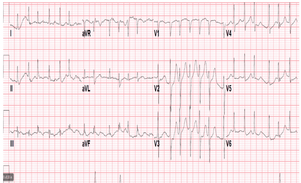
FIGURE 1: Atrial Fibrillation with Rapid Ventricular Response