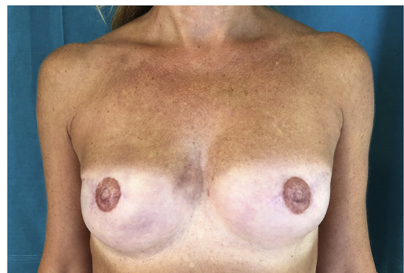
Fig. 3. In this bilateral breast reconstruction there isn't uniform density of NACs pigmentation and a further correction is needed.