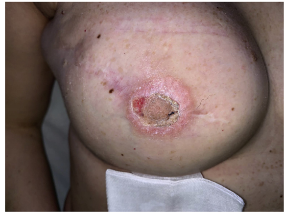
Fig. 1. The tattoo was performed three months after the nipple reconstruction. The difficulty in healing was due to the thinness of skin. Complete healing is shown in Fig. 2.