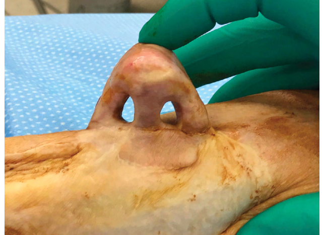
Fig. 3. The composite flap construct is shown on the donor forearm before transfer. Nostril apertures were created following the initial prelamination procedure.