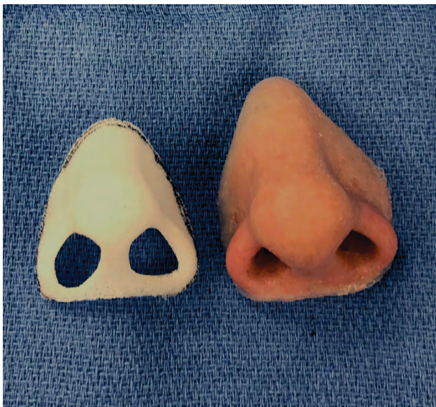
Fig. 2. Three-dimensional printed custom PPE scaffold (left) compared to the silicone prosthesis upon which the scaffold was based.