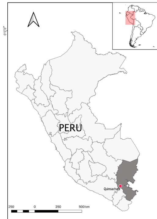
Figure 1. Geographical localization of the Camelid Germplasm Bank—Quimsachata in the Department of Puno, Peru at around 4200 m above sea level (map created with DIVA-GIS software).