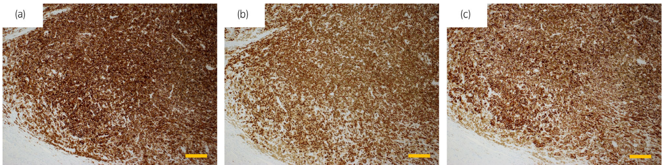
Fig. 2 Immunohistochemistry findings. The tumor cells were positive for (a) HMB-45, (b) SOX10, and (c) melanin A. Scale bar shows 100 \mu m.

node dissection is not recommended in patients with malignant melanoma of the male urethra and penis due to the low possibility of positive findings, and lack of benefit on the overall survival. 19 In the present case, we did not perform lymph node dissection because there was no apparent inguinal lymph node swelling on computed tomography. However, SLNB is considered to be useful in the evaluation of melanomas with a thickness of \geq 1 mm according to the National Comprehensive Cancer Network guidelines. Therefore, SLNB of inguinal lymph node dissection might be considered in our case.