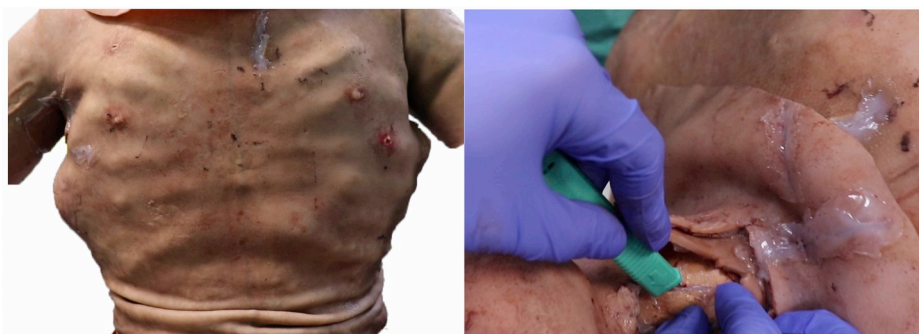
Fig. 2. Hyper-realistic training suit by PPA-International Medical a) Suit for multi-trauma cases on a simulated-patient b) Surgical tracheostomy performed by a student during the high-fidelity scenario.

Participants' NTS performance was higher in the low-fidelity intervention as assessed by the TEAM tool using the video recordings. This was true both for the mean of the 11 items of the questionnaire assessing leadership, teamwork and task management, and also for the global score (Table 1). The difference in the mean score between the low- and high-fidelity intervention was statistically significant, as analysed by a paired samples t -test (0.42, SD = 0.41, p = 0.023 ). However, this has not been the case for the global score, which regardless being higher by 0.63 for the low-fidelity intervention, it was not statistically significant (SD = 1.19, p = 0.18 ). When inspecting the individual items of the questionnaire, statistically significant changes were noted for items 2, 7, 8 and 9.