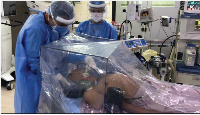
Figure 2: Tracheal intubation using a customised intubation tent