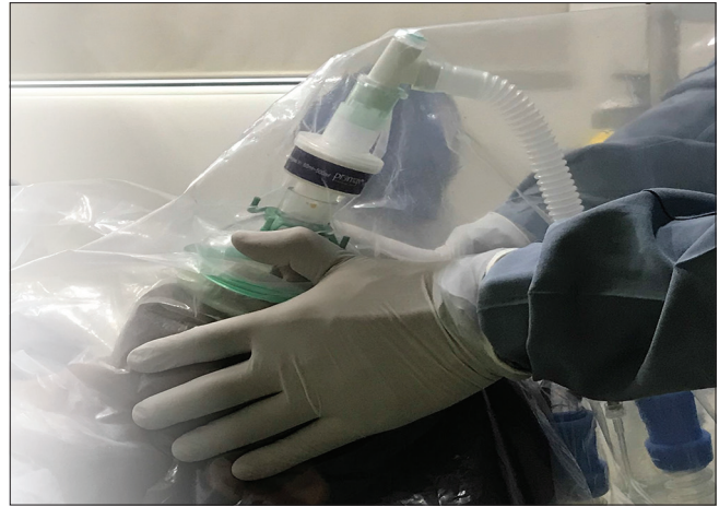
Figure 3: Patient's face covered with a transparent plastic sheet during preoxygenation