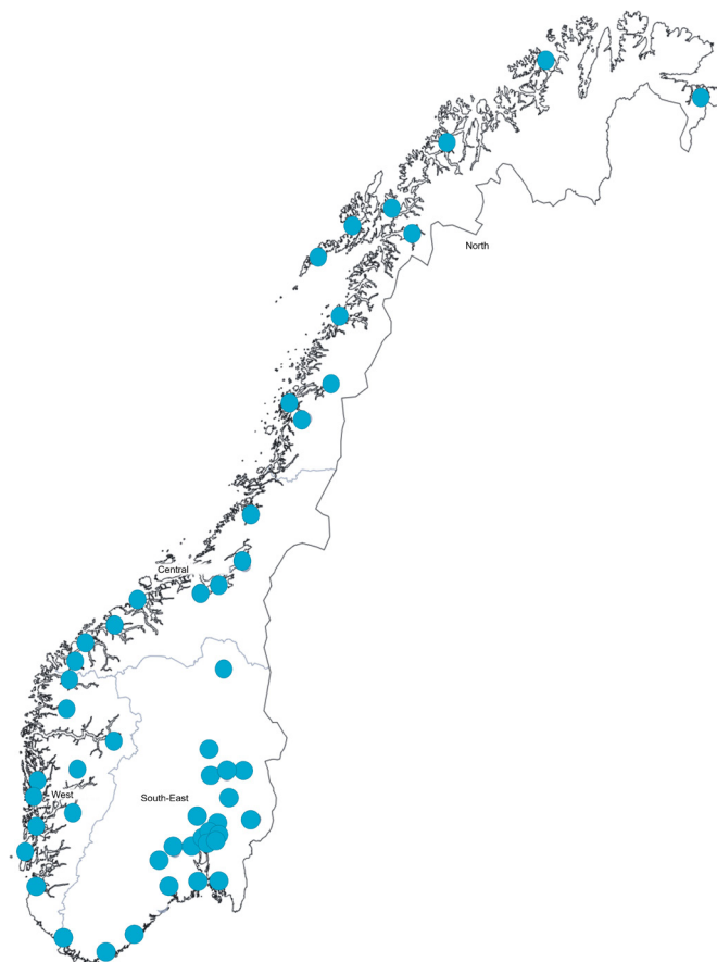
Figure 1 Hospitals with acute care function in Norway.

Within each sampled geographical area, the possible locations for data collection will constitute the sample frame for the second stage of sampling (table 1). Locations will include public places (eg, public libraries, town halls), workplaces, recreational organisations (eg, sports clubs) and healthcare providers (eg, hospitals, rehabilitation institutions). The bodies concerned must be willing to grant the study permission for data collection and cooperate with provision of a suitable space for completion of the interviews. The locations will act as clusters of possible respondents, stratified into groups based on the characteristics of target respondents, for example, age and educational level. Stratification will increase homogeneity per cluster and ensure the representation of specific groups less likely to participate including those with poorer health, lower socioeconomic status, or faced with time constraints, including those with young children or in full-time employment. 51 Locations within each