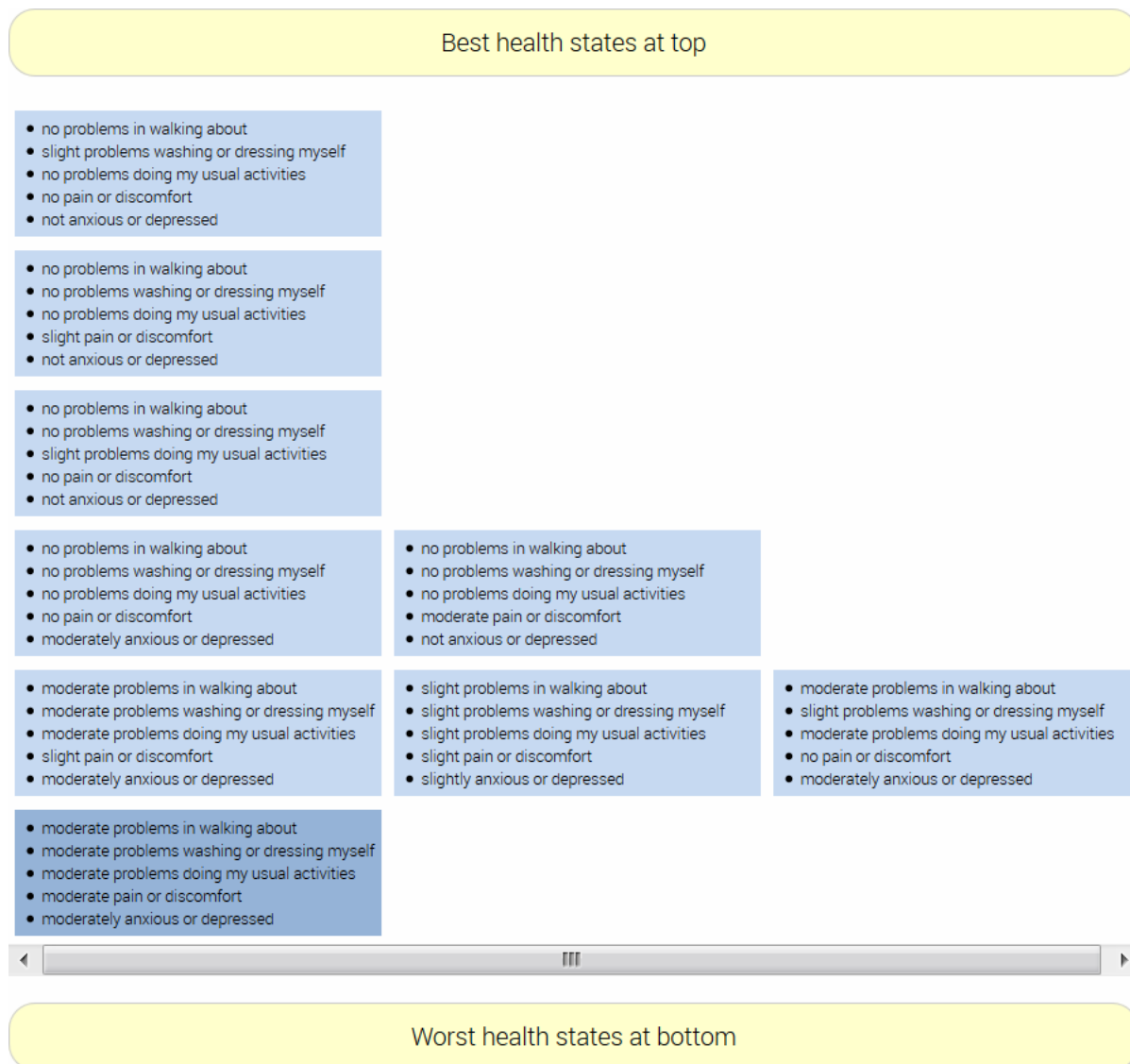
Figure 4 Screenshot of the feedback module in EQ-VT. EQ-VT, EuroQoL valuation technology.

between them. Data collection involves a small number of interviewers working over an 8-month period.