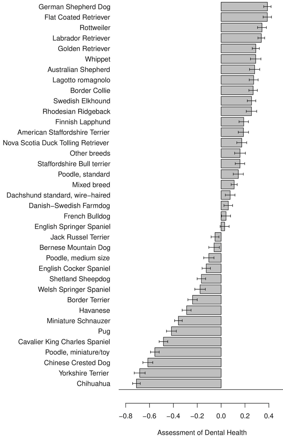
FIGURE 3 | Association of breeds with owners' assessed symptoms of their dog's dental health. Reported for breeds with \geq 400 respondents. Higher construct score represents a relatively better perceived dental health. Scores should only be compared within figure. Note that negative scores do not automatically reflect a negative assessment of dental health.