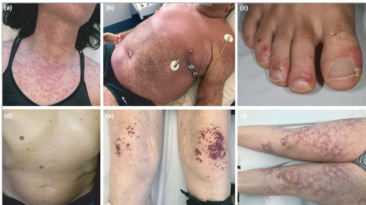
Figure 1 COVID-19-associated cutaneous manifestations. (a) Urticarial rash. (b) Combination of confluent erythematous rash on the chest with petechial lesions on the abdomen and upper extremities. (c) Acral chilblain-like lesions on the foot. (d) Vesicular exanthem. (e) Palpable purpura on the knees. (f) Livedo racemosa-like lesions on the thighs.

degradation products in these patients would be enlightening. 28 In patients with severe COVID-19, vasculopathic lesions might be more pronounced and/or persistent, being the epiphenomenon of uncontrolled systemic microvascular damage or coagulopathy. Interestingly, livedoid and necrotic lesions have been suggested to occur in elderly patients with severe systemic symptoms, likely representing the cutaneous manifestations associated with the highest rate of COVID-19-associated mortality. 32