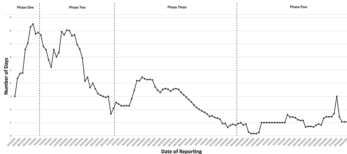
Fig. 3. Seven-day moving average of the onset-to-admission interval (in days) for all confirmed cases. [Au?2]

measures and the epidemic trend could not be established. In addition, the contribution of the effect of individual measures could not be assessed.