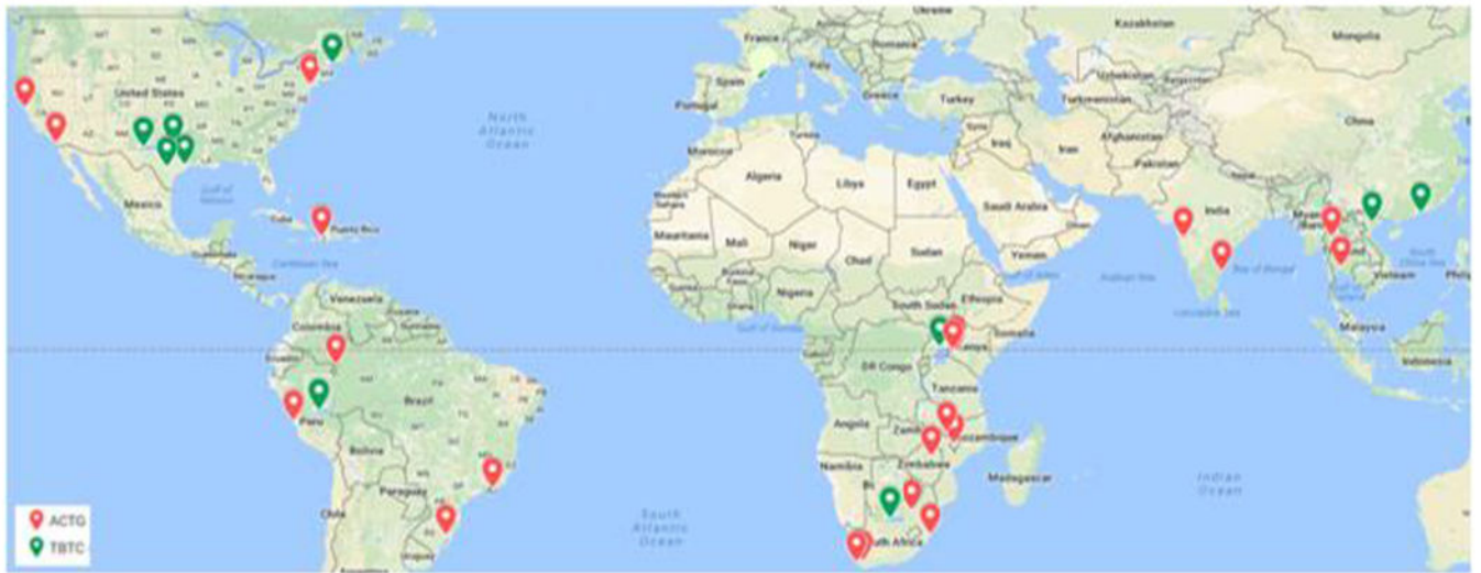
Figure 2. Geographic distribution of enrolling study sites for the trial “Rifapentine-containing treatment shortening regimens for pulmonary tuberculosis: a randomized, open-label, controlled phase 3 clinical trial (S31/A5349)”