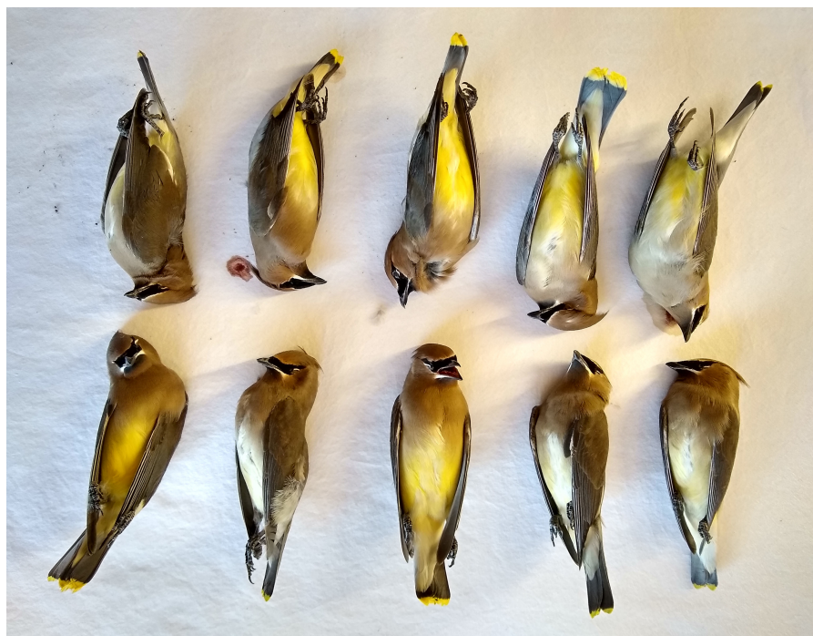
Figure 3 Ten Cedar Waxwings dead from collisions on two adjacent buildings.