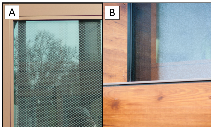
Figure 1 Bird-friendly windows including (A) fritted window and (B) Arnold Glas/ORNILUX bird protection glass.

Building 1 also had 119 m 2 of mirrored windows. Data were collected in fall (September 12–October 27, 2019) and winter (October 29, 2019–January 24, 2020) at the University of Utah, Salt Lake City Utah, USA. Monitoring included all four sides (for buildings 1, 2, 4, 5, and 6) and particular sides (for 3, 7, and 8).