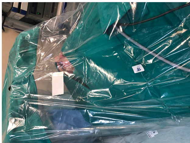
Fig. 1 Nasal tent draped over the patient