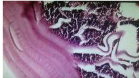
Fig. 1: Laminated collagenous layer, hydatid cyst (X1000)

human cyst samples, were subjected to genotyping of E. granulosus using the nad1 and cox1 genes. From all samples, 49 (68.06%), 19 (26.38%) and 4 (5.56%) were from liver, lung and spleen, respectively. Overall, 43 (59.73%) of cysts were from male and 29 (40.27%) were from female patients.