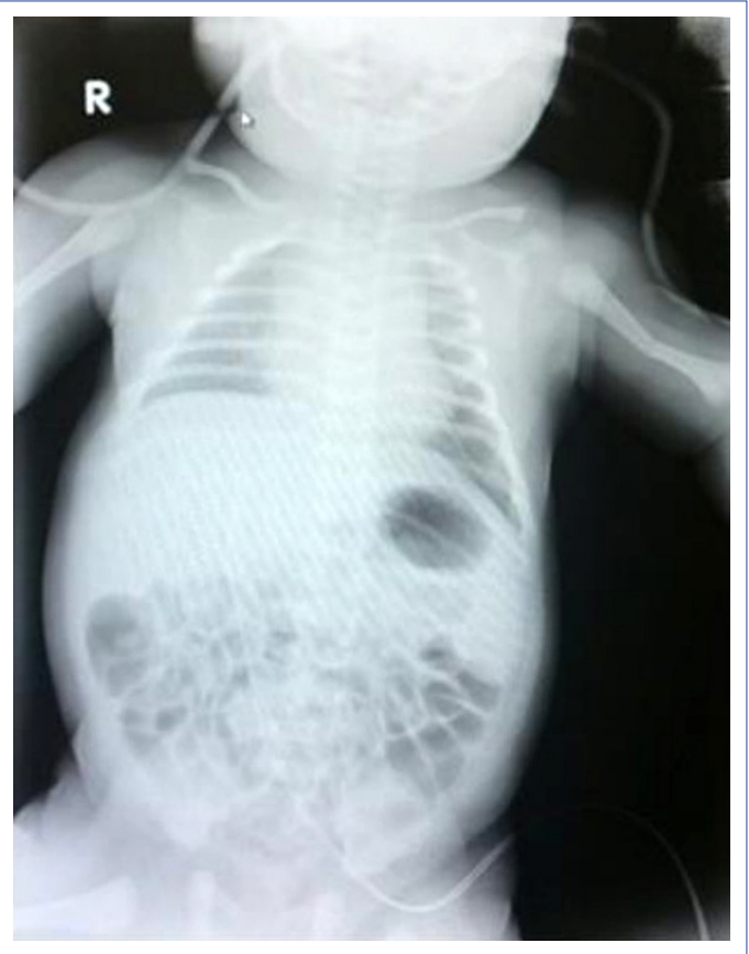
Figure 2. Left humeral diaphysis fracture.

Long bone fractures are frequently associated with maneuvers performed during vaginal deliveries of babies with a breech presentation. However, emergency cesarean deliveries have a greater risk for long bone fractures compared with vaginal deliveries. Premature birth, malpresentation, malposition, and multiple pregnancy may predispose to long bone fracture. [4] Long bone fractures are also associated with neonatal osteoporosis. [5] In addition, pathological fractures may be related to osteogenesis imperfecta, rickets, or child abuse. [6] The incidence of long bone injuries has been reported as 0.23 to 4 per 1000 live births. [4,7,8] The incidence of humeral fracture has been reported as 0.05 per 1000 live births. [5,7,8] Spontaneous delivery of our case