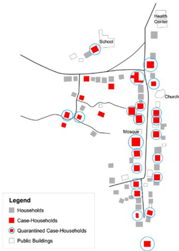
Fig. 1. Schematic map of Village X, Sierra Leone, indicating cumulative Ebola case-household status and quarantine status from 1 August 2014 to 10 October 2014.