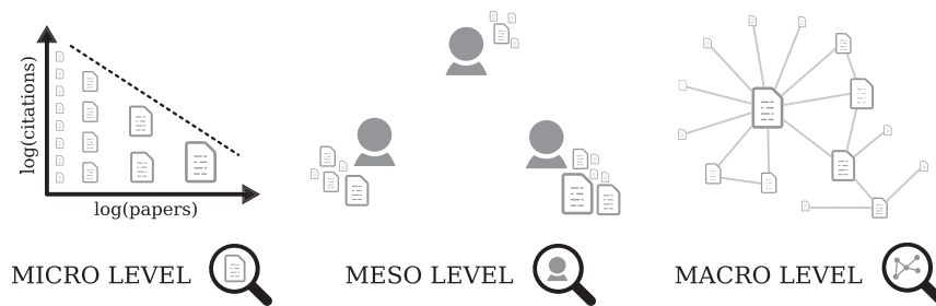
Fig. 1. Different levels of analysis of bibliometric datasets. On the microlevel we describe the distribution of the number of citations of individual papers, irrespective of who authored them as well as which articles actually referenced them. The rarely studied mesolevel, which is the perspective of this contribution, accounts for the author-specific differences. The structure of the citation network in its entirety is studied at the macrolevel.

For the derivation of the model please refer to Materials and Methods, Model Description . The citation process proposed above, after all of the N papers have been published and all of the citations have been distributed, yields the following analytic formula for the estimated number of citations of the k th most cited paper ( Materials and Methods, Exact Solution of the Model ):