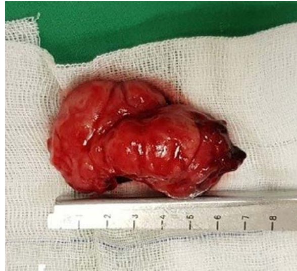
Figure 3. Surgically resected polyp.