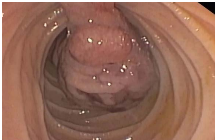
Figure 1. Endoscopic view of polyp before removal.

known, but hypothesis is it might be related to hyperacidity of the stomach. 5 Another hypothesis is that Helicobacter pylori might play a role in formation of BGH. 4 Most of the patients are asymptomatic. In symptomatic patients, most common presentation