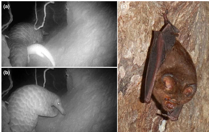
FIGURE 3 (a) Female and infant giant pangolin; (b) our focal male and (c) Hipposideros ruber are observed using the same burrow [Colour figure can be viewed at wileyonlinelibrary.com ]