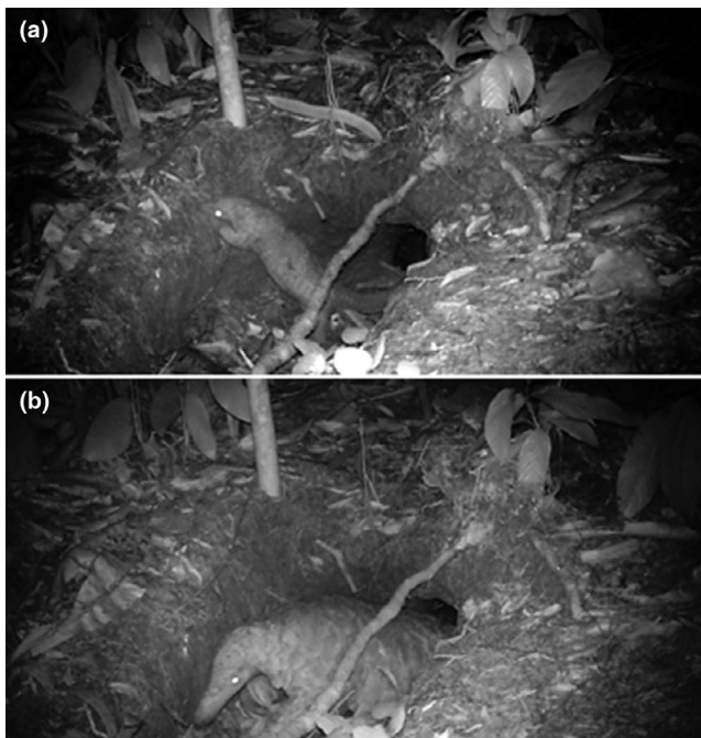
FIGURE 2 (a) White-bellied ( Phataginus tricuspis ) and (b) giant ( Smutsia gigantea ) pangolins emerging from the same burrow

females with infants that were never observed together. Six of the burrows were frequently visited by a large lone female; with whom the male was observed walking, feeding and interacting during successive nights. Burrows were rarely used on two successive nights. Two hollow trees were occasionally visited.