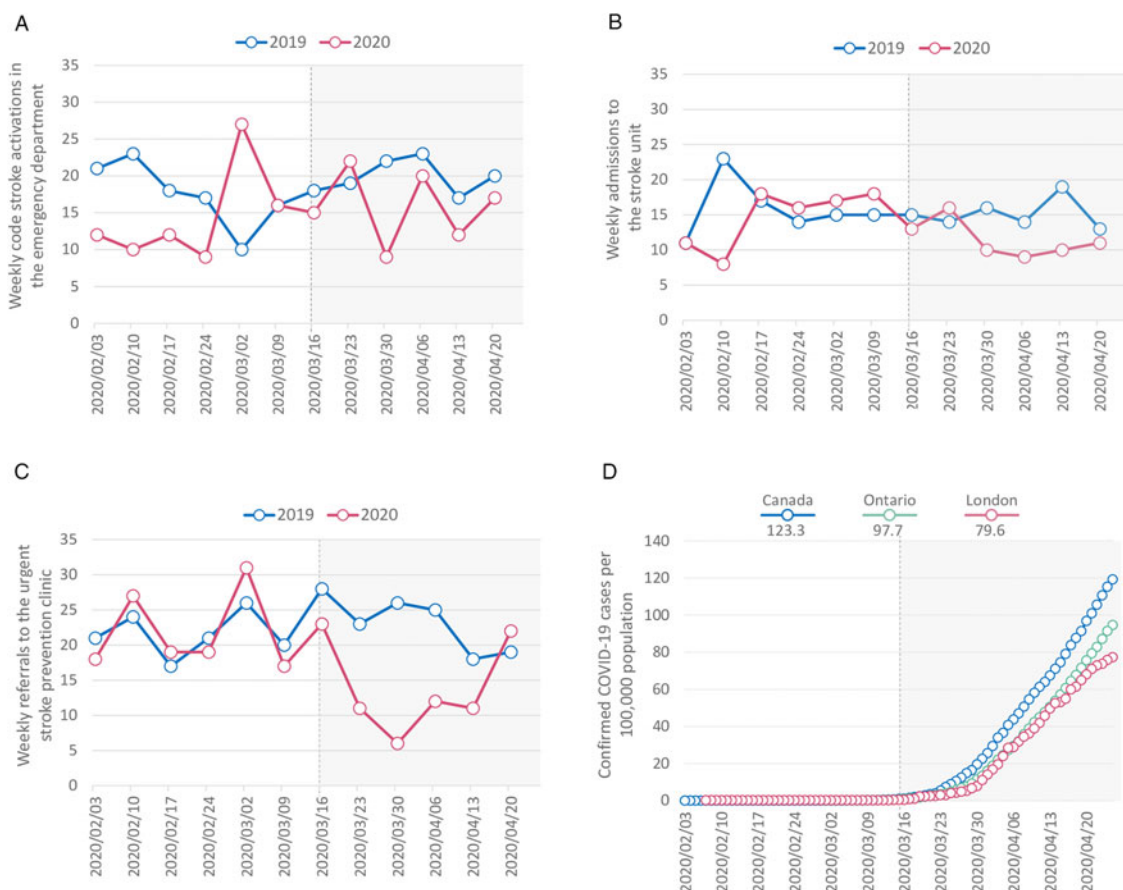
Figure 1: Weekly stroke team activations and urgent stroke prevention clinic referrals. Panel A: Weekly code stroke activations in the ED. Panel B: Weekly stroke admissions. Panel C: Weekly referrals to the urgent stroke prevention clinic. Panel D: Confirmed cases of COVID-19 in London, Ontario, and Canada per 100,000 population since February 3, 2020. The vertical line represents the date of the provincial lockdown and the shades show the time window thereafter.

because this is the first day of WHO epidemiological weeks and it also allows for mitigating the bias of weekdays vs. weekend consults. We used the same WHO epidemiological weeks of 2019 as a comparator. We compared epidemiological weeks of 2020 vs. 2019. These are matched weeks in both years, which are used for mitigating the bias of seasonal variations in stroke consults. Code strokes included patients brought to the ED by the Emergency Medical Services and walk-in strokes. Additionally, we quantified hemorrhagic and ischemic stroke admissions to the stroke unit and referrals to the urgent stroke prevention clinic during the same period by reviewing the London Ontario Stroke Registry, the inpatient census, and London Health Sciences Centre’s electronic booking system. The stroke registry is updated on a real-time basis. Clinic referrals consist of patients with minor strokes or transient ischemic attacks (TIAs).