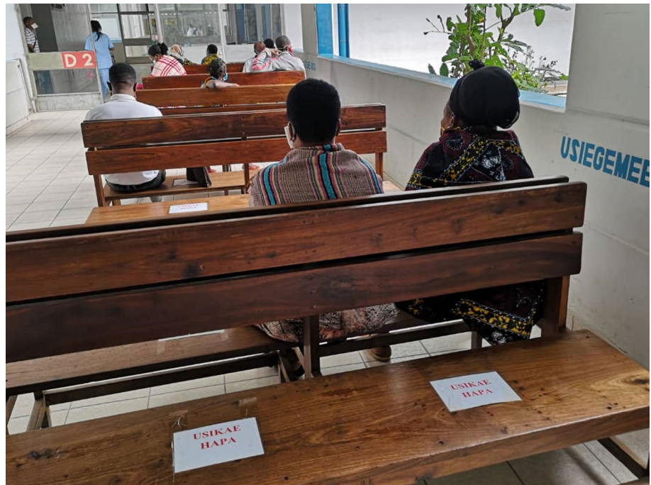
Fig. 2 Physical distancing in practice in an outside waiting area at an HIV clinic in East Africa

to obtain ART at health facilities closer to home. In some cases, though, this has resulted in unintended disclosure of HIV status in their communities.