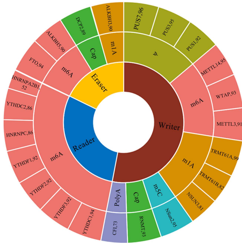
Figure 2. Statistical analysis of RNAWRE. The number effectors in each kind of modifications.

transmit user query information and rapidly extracted data from MySQL databases management to generate report pages.