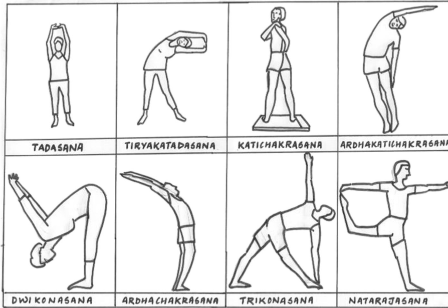
Fig. 1. Diagram depicting the “Standing Group of Asana”.

At the end of the 4-week study period, the pain score in the Y and NY group was 20.47 (3.37) and 20.14 (3.15), respectively ( p = 0.666 ), whereas the corresponding disability scores were 20.4 (5.84) and 19.7 (5.31) ( p = 0.599 ). However, the difference in the total SPADI scores of the two groups was not statistically significant (40.67 vs. 40.03, p = 0.736 ). In both groups, the incremental gain in terms of pain and disability reduction was statistically significant ( p < 0.05 ), based on the findings of repeated measure analysis of variance. However, when the scores of the two groups were compared, their difference was not statistically significant, as