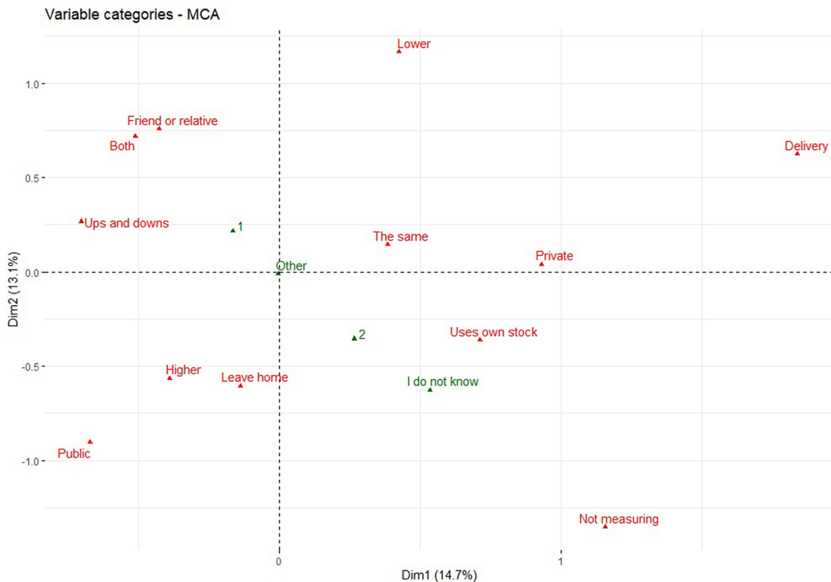
Fig. 3 – MCA for glycemya measures, method for buying/receiving medicine, health system, and type of diabetes (supplementary).

and glycemya levels of T1D individuals (right side of Fig. 2), with significant perceived changes, T2D respondents seem to have maintained most of their habits during this period.