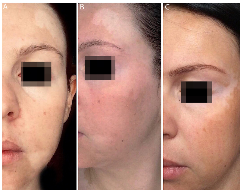
Figure 2 (A and B) Prior to treatment, white macules all over the face. (C) After two years of treatment, complete repigmentation of the forehead and perilabial macules is observed, as well as an improvement of the rest of the face.

these treatments have limited efficacy. 2 Several articles have shown that blocking the Janus kinase/signal transducers and activators of transcription (JAK-STAT) pathway with tofacitinib may produce repigmentation, provided frequent exposures to the sun or phototherapy. 3