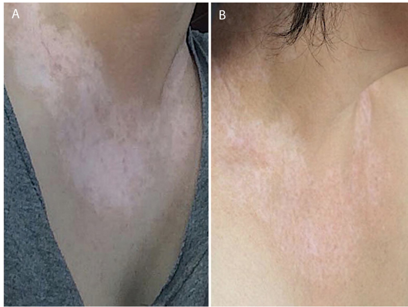
Figure 3 (A) Prior to treatment, various white macules. (B) After two years of treatment, repigmentation improvement is noted.