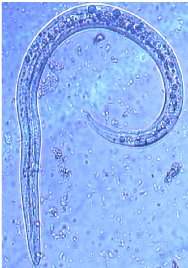
Figure 2 Baermann test: Angiostrongylus vasorum , first stage larva.

gold standard to diagnose angiostrongylosis. Nonetheless, this test is relatively time-consuming (8–36 hours), requires operator skills, and has inherent shortcomings, such as the inability to detect the parasite during the prepatent period and when larvae are not being shed, even in the presence of severe clinical signs. The prepatent period of A. vasorum is long and variable, ranging from 1 to 4 months, although the patency usually begins between ~40–60 days after infection. 6,13,100,103