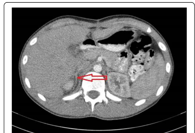
Fig. 1 Normal appearance of adrenal glands is evident in postoperation computed tomography scan shown with arrow (after tumor resection and before adrenalectomy)

A computed tomography (CT) scan of his chest, abdomen, and pelvis with intravenously administered contrast revealed no adrenal mass or significant lymphadenopathy. Normal appearing right adrenal gland visualized in Fig. 1. Hyperparathyroidism was ruled out by neck ultrasonography and by normal serum calcium, phosphorous, and parathyroid hormone level. Following a multidisciplinary board meeting, 2 weeks after the first laparotomy, our patient underwent right adrenalectomy through a right subcostal incision (anterior approach). Pathology reported normal adrenal tissue with mild hyperplasia in the adrenal medulla. He was discharged with no unexpected event on postoperative day 4.