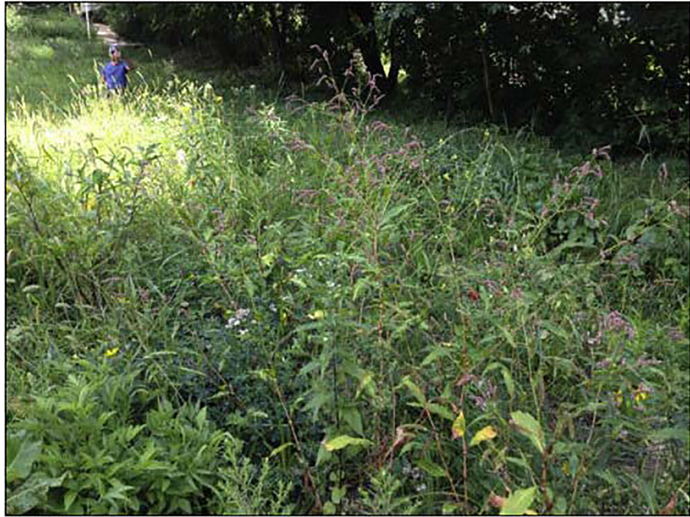
Figure 3. Cleveland Botanical Garden rain garden.