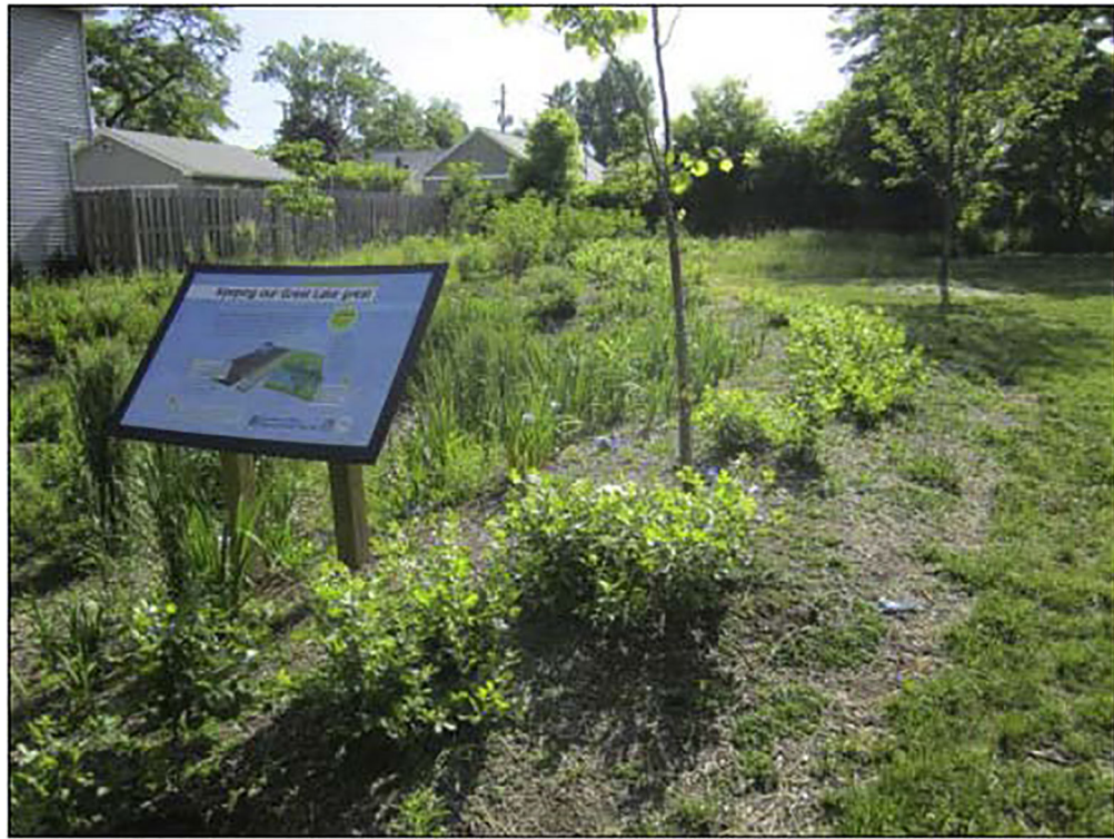
Figure 2. Northeast Ohio Regional Sewer District rain garden.