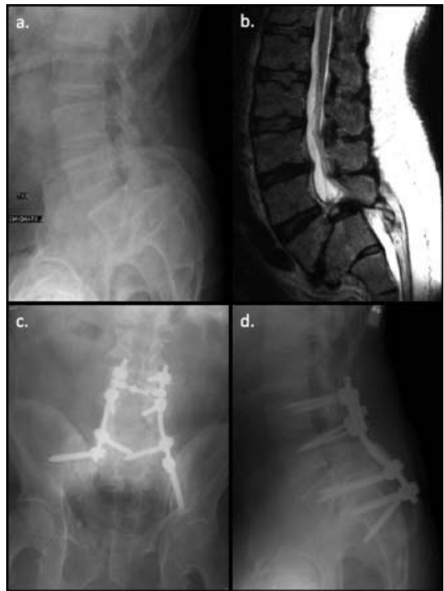
Figure 2. This is a 56-year-old male who presented with right leg weakness and urinary incontinence. (a) Lateral lumbar plain radiograph and (b) T2-weighted magnetic resonance imaging of the lumbar spine demonstrated a Meyerding Grade IV spondylolisthesis at L5-S1. As depicted in the (c) anteroposterior and (d) lateral lumbar plain radiographs, he subsequently underwent a laminectomy at L4-S2, a posterolateral fusion from L3-Pelvis, a sacral dome osteotomy, with an additional L5-S1 discectomy and mixed allograft and local autograft placement. No formal reduction maneuver was attempted intraoperatively.

Indications for surgical management of HGS include persistent symptoms, failure of conservative management, radiographic parameters suggestive of imminent slip progression, significant biomechanical stress, and global sagittal imbalance. This section provides an overview of various surgical techniques used in the treatment of HGS in adults, in particular for progression of isthmic slips, which usually present symptomatically when unbalanced. The most common surgical techniques include (1) in situ fusion techniques using posterolateral, anterior, or circumferential approaches; (2) fusion and