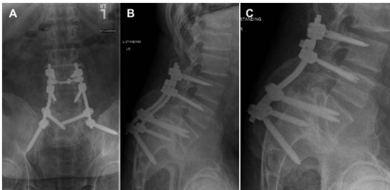
Figure 3. Three views of circumferential interbody fusion using transsacral fixation in a patient with high-grade spondylolisthesis (HGS). (A) Anteroposterior (AP) radiograph of sacral pedicle – vertebral body (transsacral) fixation. (B) Lateral radiograph of the sacral pedicle – vertebral body fixation. (C) Dedicated lumbar radiograph of the transsacral lumbar fusion from L3-S1.

balance the tensile forces that the posterior fusion mass is ultimately exposed to in patients with high-grade slips. Finally, a circumferential fusion is completed by placing posterolateral bone graft from L4 to the sacral alae. This technique also has the advantages of providing a wider surface area for bony fusion, restoring disc height to indirectly decompress neural foramen, and provides anterior pivot to allow a more effective correction of the lumbosacral kyphosis with the use of posterior instrumentation. 7