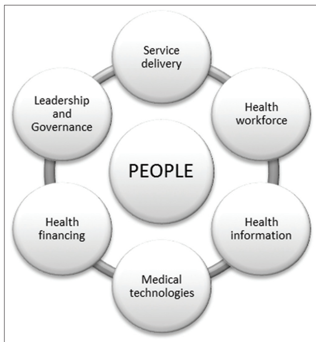
Figure 1: Building blocks of health systems