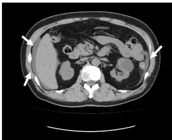
Figure 1. Abdominal computed tomography of the patients. Slight ascites and thickening of the peritoneum with edema were found (arrows).

During the 2 years following onset of chronic kidney disease, she experienced repeated infectious diseases, including cytomegalovirus and aspergillosis. Kidney function was gradually worsened due to long-term administration of nephrotoxic agents, including tacrolimus (controlled concentration range: 5–10 ng/mL), voriconazole, and valganciclovir. CAPD was started after 2 years of follow-up on an outpatient basis.