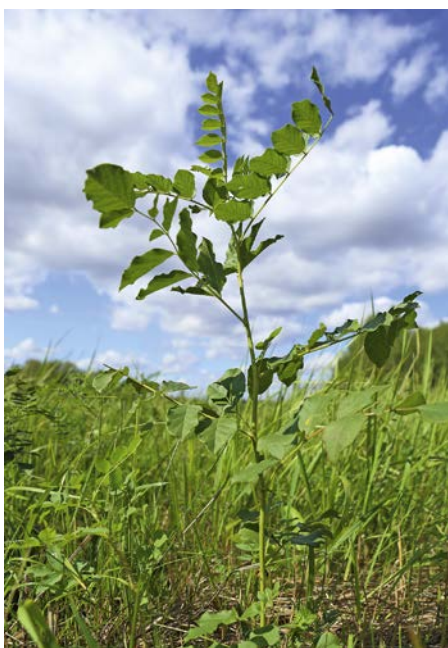
Fig. 85.1 Glycyrrhiza glabra .

Most herbalists generally believe that glycyrrhiza exhibits alterative action on estrogen metabolism (i.e., when estrogen levels are too high, it inhibits estrogen action, and when estrogens are too low, it potentiates estrogen action when used in greater amounts). 4 Glycyrrhetic acid has been shown to antagonize many of the effects of estrogens, particularly exogenous estrogens. 5 The estrogenic action of glycyrrhiza is a result of its isoflavone content, as many isoflavone structures (e.g., daidzein and genistein from soy) are known to possess estrogenic effect. The estrogenic activity of the isoflavones appears to be more significant than the estrogen antagonism of glycyrrhetic acid. 6 Interestingly, these same components inhibit breast cancer cell growth. 7