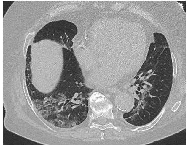
Fig 3. CT scan showing predominantly right lower lobe crazy-paving associating ground-glass opacities and interlobular reticulations.

prior, associated with nausea and diarrhoea. Physical examination showed a diffuse abdominal pain without guarding. Blood pressure was normal at 140/90 mmHg. Blood tests demonstrated lymphocytopenia ( 0.63 \times 10^9/L ) and an elevated C-reactive protein at 231 mg/L. SaO_2 was 94%. The rest of the laboratory tests were normal: Hb 14.2 g/dL, WBC 4.63 \times 10^9/L , platelets 141 \times 10^9/L , AST 61 IU/L, ALT 27 IU/L, bilirubin 11.5 \mu\text{mol/L} , troponin T 30 ng/mL and lactate 1.6 mmol/L. An abdominal CT scan was performed, demonstrating predominantly right lower lobe crazy-paving associating ground-glass opacities and interlobular reticulations (Fig 3). The patient tested positive for COVID-19 by RT-PCR. Two days later, her pulmonary status severely worsened, and she was transferred to the ICU and intubated.