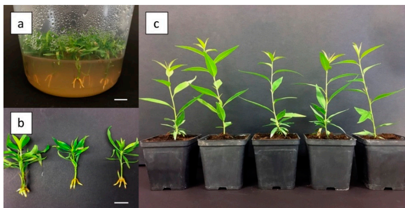
Figure 2. In vitro rooting and acclimatization of adventitious shoots from Hansen 536 leaves: (a,b) elongated and rooted in vitro adventitious shoots ready for acclimatization and (c) acclimatized rooted shoots in 7 \times 7 cm pots.

Adventitious shoots developed in the above treatments were in vitro elongated, rooted, and acclimatized. About 85% of them were able to produce in vitro roots (about 0.5–1 cm long) after 20 days in the rooting medium (Figure 2a,b), and about 90% of them were successfully acclimatized to the greenhouse (Figure 2c).