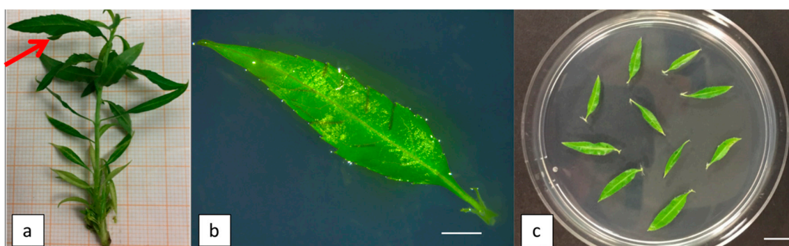
Figure 3. Plant material used as the starting explants in this study: (a) leaves collected from 3-week-old elongated shoots of Hansen 536. The arrow indicates the type of leaf collected and used in all the regeneration experiments; (b) the young leaf of the Hansen 536 wounded perpendicular to the mid vein and placed with the abaxial side on regeneration medium (bar = 2 mm), and (c) in vitro leaves of Hansen 536 placed on regeneration medium (bar = 1 cm).

The first four apical expanding leaves (about 1.5–2 cm in length) along with their petiole from 3-week-old elongated shoot cultures were used as starting explants in this study (Figure 3a). The abaxial surface of each leaf was wounded about four times at each side perpendicular to the leaf mid vein, leaving the sections intact, and then placed with the abaxial side in contact with the regeneration medium (Figure 3b,c). Leaves were cultured on WPM basal salts and vitamins, 30 g L -1 sucrose and 5 g L -1 plant agar S1000 (B&V, Reggio Emilia, Italy); the pH was adjusted to 5.7 before autoclaving at 121 °C for 20 min, and then 25 mL of medium was poured into sterile plastic Petri dishes (9 cm × 1.5 cm). After leaves were placed on medium, the dishes were maintained in darkness at 24 ± 1 °C for three weeks. In vitro leaves were then transferred to fresh media and exposed to light (16-h photoperiod at a light intensity of 40 μmol/m 2 /s) at 24 ± 1 °C. Data on the leaf regeneration frequency and on the average number of regenerating shoots per leaf were collected after five weeks from the beginning of the trial.