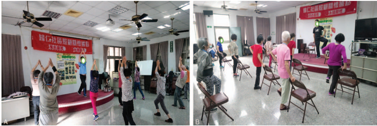
Figure 3. Conventional Exercise Group: (A) lower-body strengthening exercise; (B) second stage employed chairs as an assistive tool to train their balance.

Destination Bollywood uses brisk rhythms and dance moves, rhythmic dancing involving all limbs, and abdomen and hip exercises to train participants to shift their center of gravity and slow to fast movements, thereby enhancing dynamic balance.