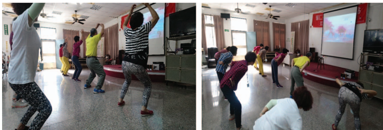
Figure 2. Kinect Exercise Group: exergames included Zen Energy, Yoga, Destination Bollywood, Cardio Boxing, Humana Vatality and Cardio.

Yoga is a relaxation and coordination game that emphasizes stretching, stability, coordination, and control. It can train the muscle coordination and stability of the core muscles and lower limbs.