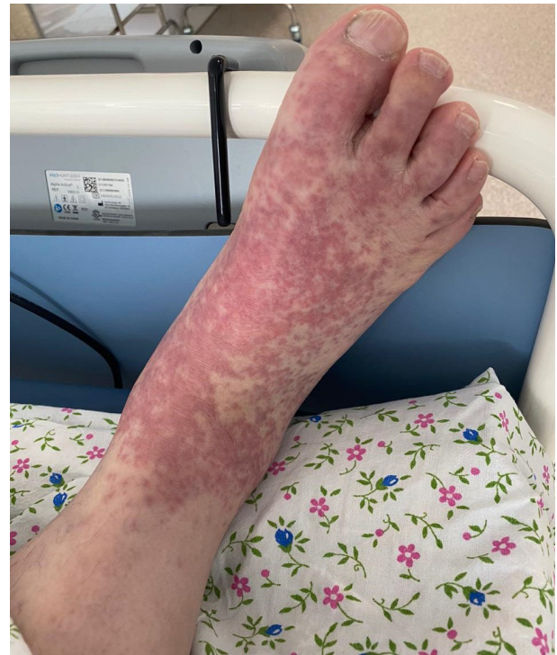
Figure 6 Erythematous rash on the feet of a 58-year-old male patient

Given that millions of patients have been infected with COVID-19 and no associated pathognomonic dermatologic phenomenon