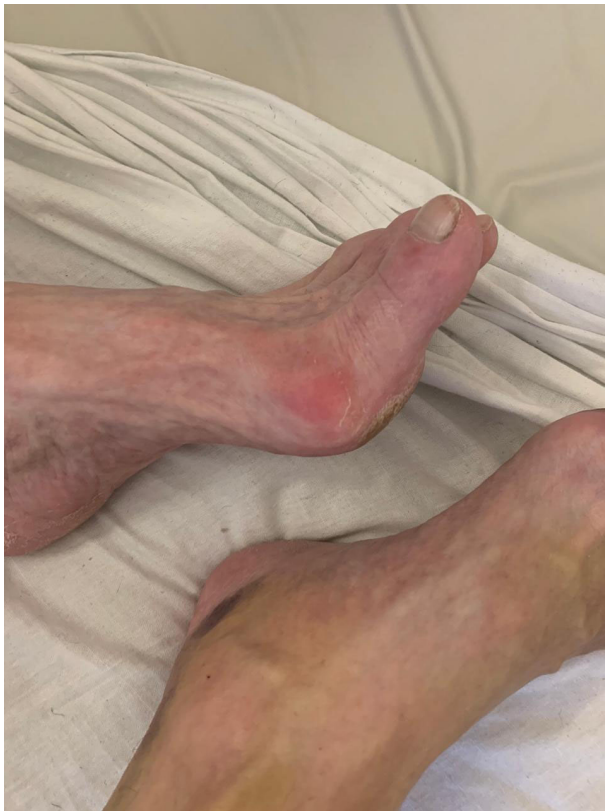
Figure 5 Acrodermatitis (pernio-like lesions) in a 63-year-old male patient

periphery of the foci, and underwent regression when systemic corticosteroids were administered.