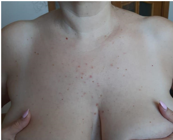
Figure 9 Papular and papulovesicular rash in a 46-year-old female patient