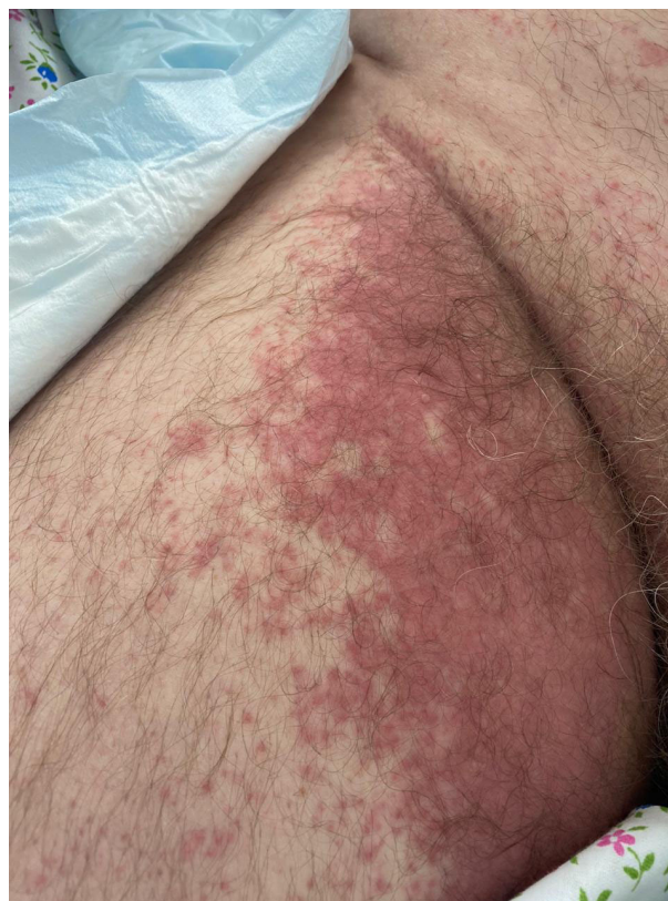
Figure 13 Bilateral inguinal purple rash in a 56-year-old male patient

presented data on 22 patients with COVID-19 infection who had papulovesicular eruptions similar to those of chickenpox. Our observations confirm the above clinical features of skin eruption with COVID-19 infection.