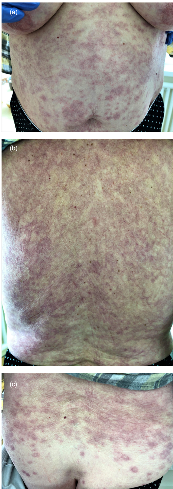
Figure 12 Probable CADR in an 83-year-old patient with elements resembling exudative erythema multiforme