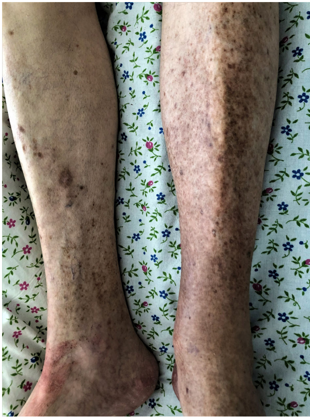
Figure 2 Polymorphic cutaneous vasculitis in a 74-year-old male patient with COVID-19 pneumonia