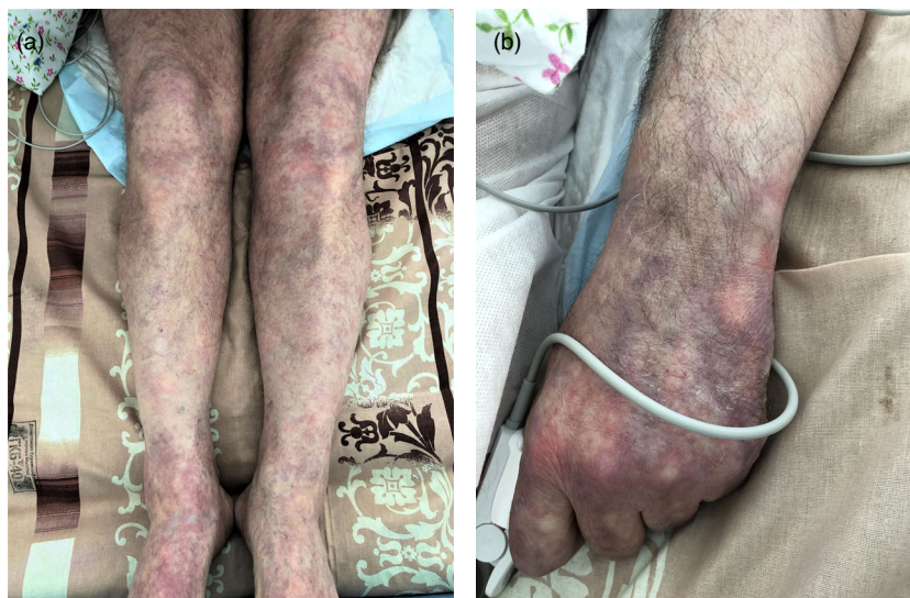
Figure 3 (a and b) Polymorphic cutaneous vasculitis in a 59-year-old male patient with severe COVID-19 disease [Colour figure can be viewed at wileyonlinelibrary.com ]

A 46-year-old female patient with confirmed COVID-19 infection and bilateral pneumonia presented with papulovesicular elements in the chest area (Fig. 9). The appearance of a rash was noted after an increase in body temperature, accompanied by sweating.