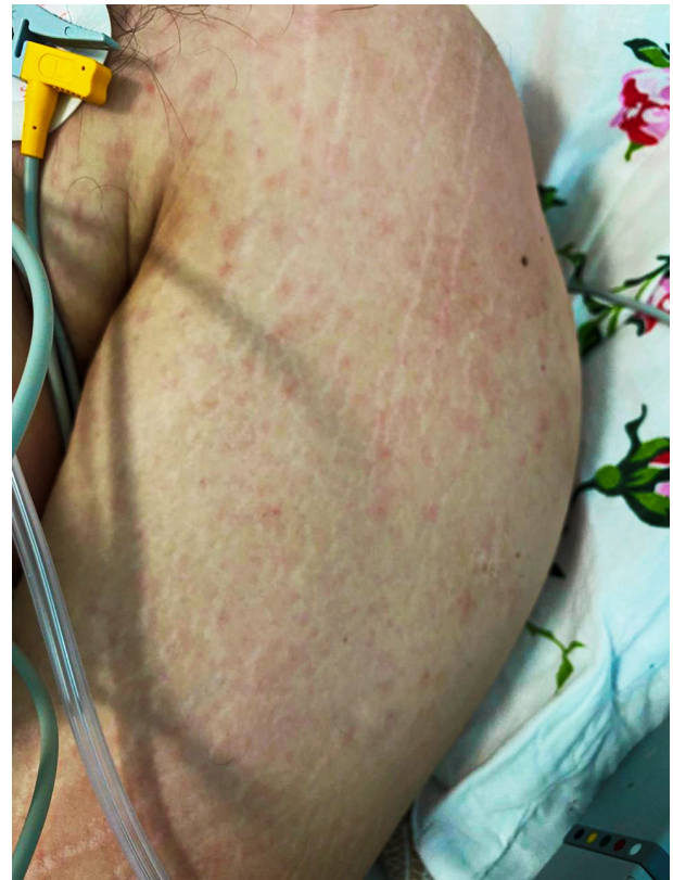
Figure 11 Measles-like maculopapular rash in a 53-year-old patient

without pruritis, which, according to the authors, is consistent with the characteristics of a viral exanthem. Avellana et al. 11 described the occurrence of a measles-like rash in a 32-year-old patient with COVID-19 on the sixth day from the onset of the disease with typical clinical symptoms of fever, dry cough, myalgia, and fatigue. Common petechial and maculopapular eruptions with an erythematous base were accompanied by pruritis and were localized to the scalp, face, neck, chest, abdomen, buttocks, and limbs, including the palms and soles. The clinical course was characterized by worsening pruritis and