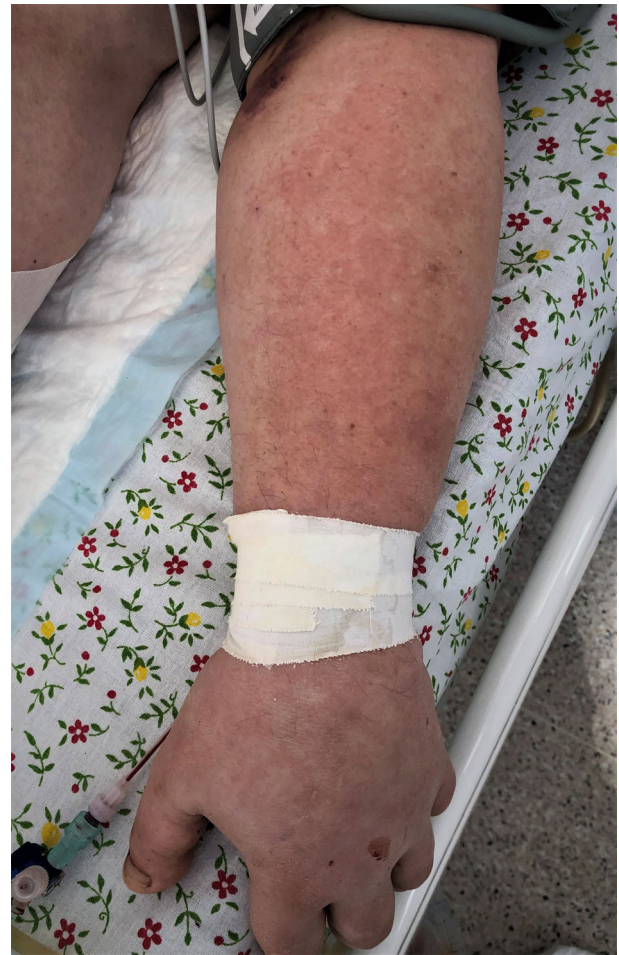
Figure 15 Post-ruptive erythematous rash of the upper limbs in a 55-year-old male patient