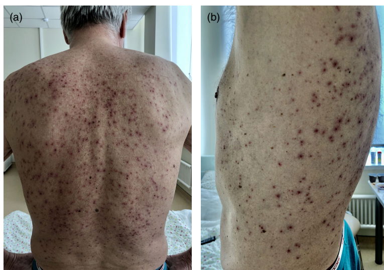
Figure 8 Papular and papulovesicular rash in a 71-year-old male patient on the back (a) and flanks (b)

Thus, there is a likely causal relationship with COVID-19 infection, as a result of the damage of the small vessels of the dermis by circulating immune complexes, activation of complement pathways, and procoagulant milieu. Tissue hypoxemia may also be contributing. Acrovasculitis and acronecrosis are some of the forms with COVID-19 induced vasculitis.