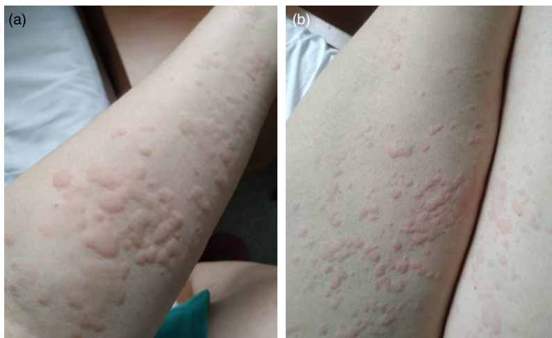
Figure 7 Urticarial rash of acral distribution in a 47-year-old female patient with involvement of upper (a) and lower (b) extremities