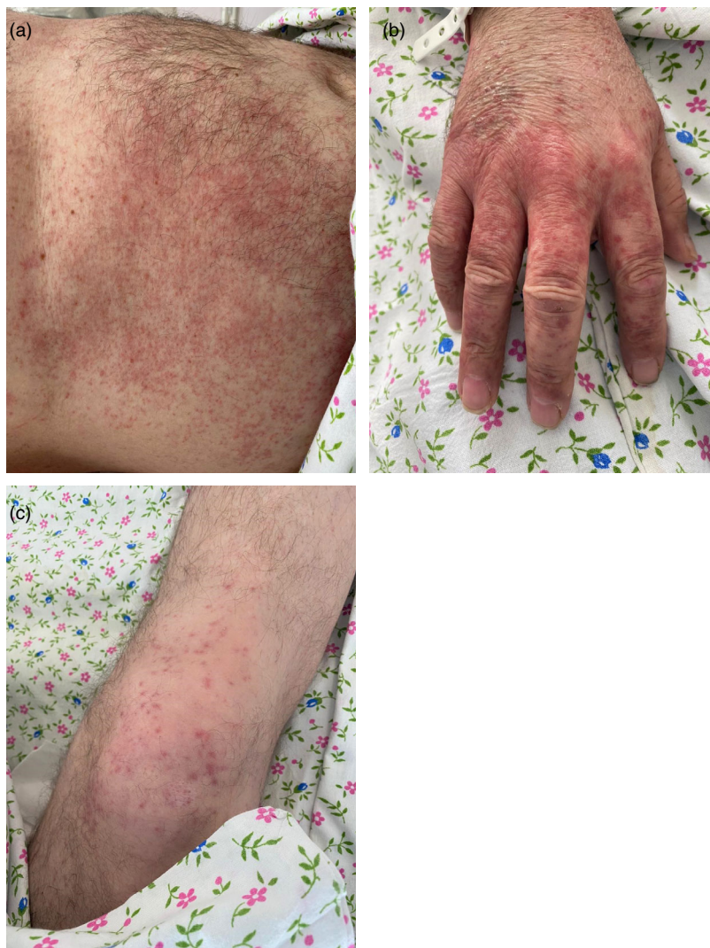
Figure 4 Hemorrhagic vasculitis in an 80-year-old male patient on the skin of the abdomen (a), hands (b), and lower extremities (c)