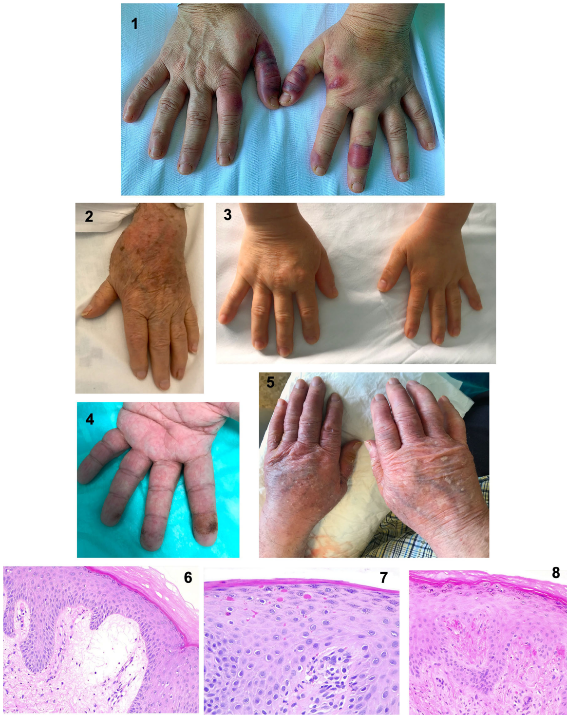
Figure 2 Edema in hands and associated skin lesions during the COVID-19 pandemic. (1) Edema in both hands, more evident in left hand, with intense chilblain-like lesions. (2) Left hand edema with an erythematous skin area. (3) Right hand edema. (4) Left hand edema with multiple dark purple micro-petechiae on the acral areas of the whole left hand fingers. (5) Symmetrical hand edema, more evident in the right hand, that included dryness, slight peeling, and erythema. (6) Histological edematous skin features: Significant serum and erythrocyte extravasation in the superficial dermis (hematoxylin and eosin, \times 40 ). (7 and 8) Extravasated erythrocytes in the epidermis (erythro transepidermal diapedic) (hematoxylin and eosin, \times 63 and \times 40 , respectively)