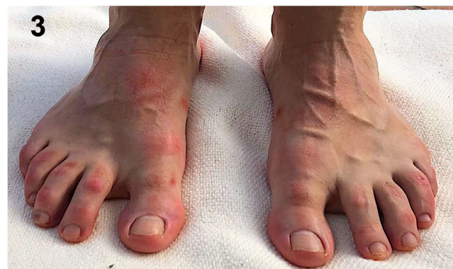
Figure 1 Foot edema and associated skin lesions during the COVID-19 pandemic. (1) Right dorsal foot edema with an erythematous skin area. (2) Symmetrical feet edema with multiple micropapular purpuric lesions in the dorsum area. (3) Both feet edema more evident in right foot with chilblain-like lesions